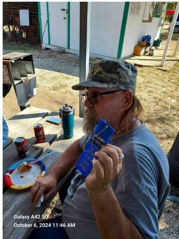
Galaxy A42 5G October 6, 2024 11:46 AM