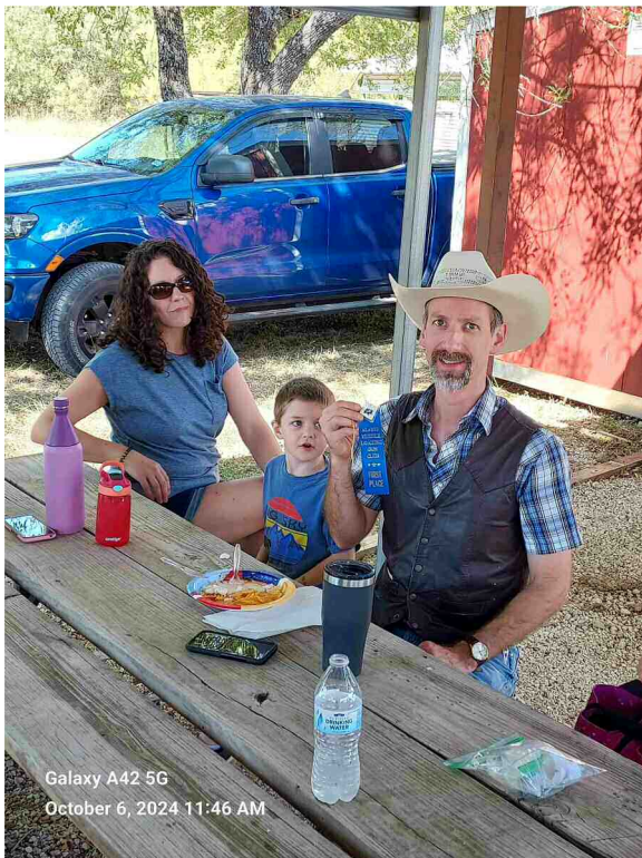
Galaxy A42 5G October 6, 2024 11:46 AM