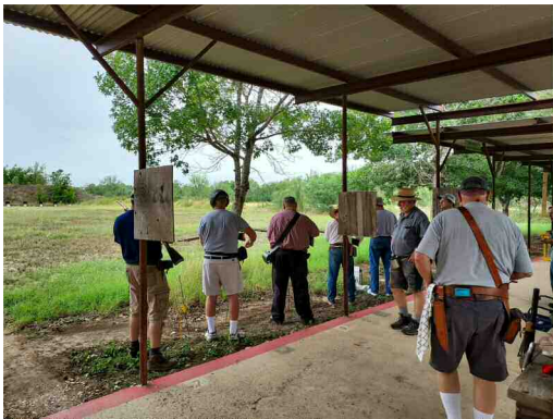
First team to shoot